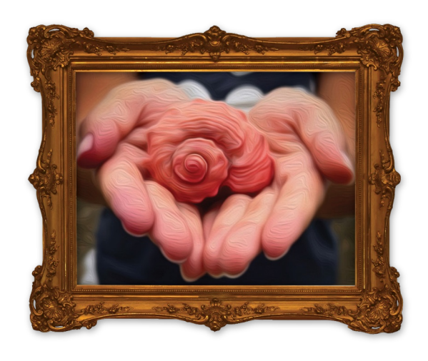
Chapter 1: The Universal Law of Divine Oneness

Did you know that there are twelve universal laws that define how our world works? By not knowing the twelve laws you are doing yourself a huge disservice. That is like playing a video game or a board game without knowing the rules. It would be hard to accomplish anything at all and it is highly unlikely you will win the game. All of our lives can be chaotic from time to time. I hope that this book can aid you in finding clarity. Clarity comes from understanding. Awareness of the twelve universal laws and how they work gives you the blueprint to how our lives and reality are shaped.