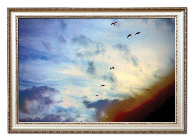
Chapter 9: The Universal Law of Attraction

Ah, the most misunderstood law of all the laws of the Universe. The Universal Law of Attraction. It is also the most popular. This is likely the only universal law that you were made aware of before reading this. That was the case for me at least and many others I've talked too. In order to really understand this law having a grasp on the basics of the other laws is essential. The universal laws are all interconnected so knowing solely of this alone is not going to get you very far.